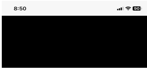
Sample Warrant Signed by a Judge